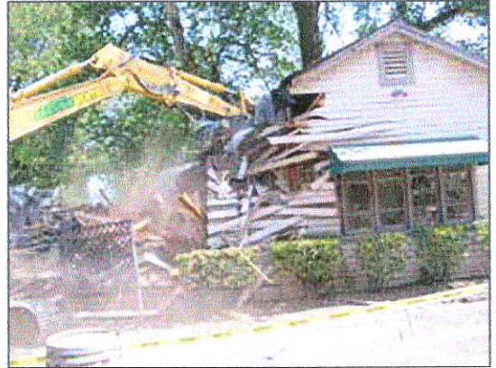
Demolition of Frank Family's old Tasting Room — the End of an Era